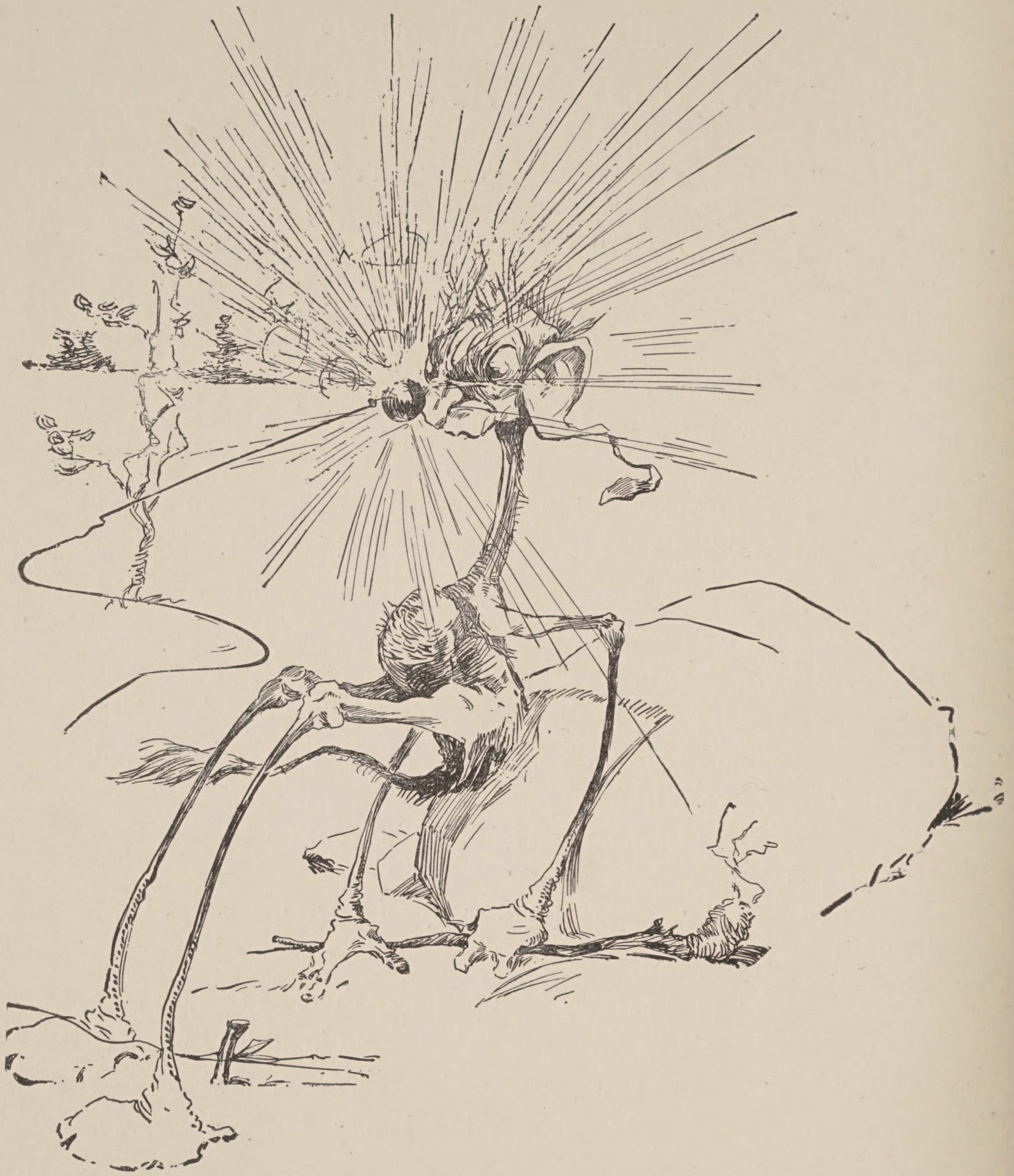
BOGEY MAN IS HIT BY THE RETURNING GOLF BALL.